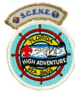
Project S.C.E.N.E. Patch, Sea base