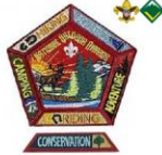
National Outdoor Awards