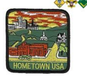
Hometown USA Award