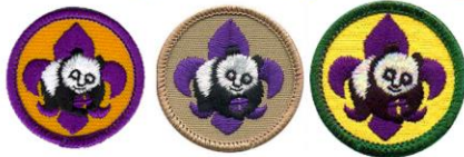
World Conservation Award