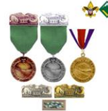
William T. Hornaday Awards