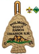
Arrowhead Patch, Philmont