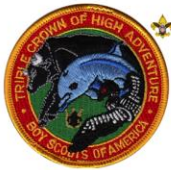
National High Adventure Triple Crown Award