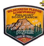
Wilderness Pledge Achievement Award