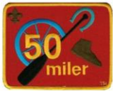
50 Miler Award