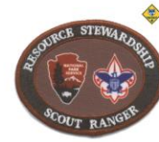
Scout Ranger Patch, NPS